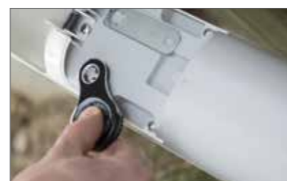
Possibility to unlock motor with transmitter