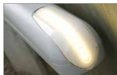
Built-in LED light mask

Manual unlock possible with Sub transmitter. Easy and user friendly