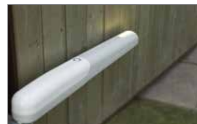
Stylish design screwless at sight